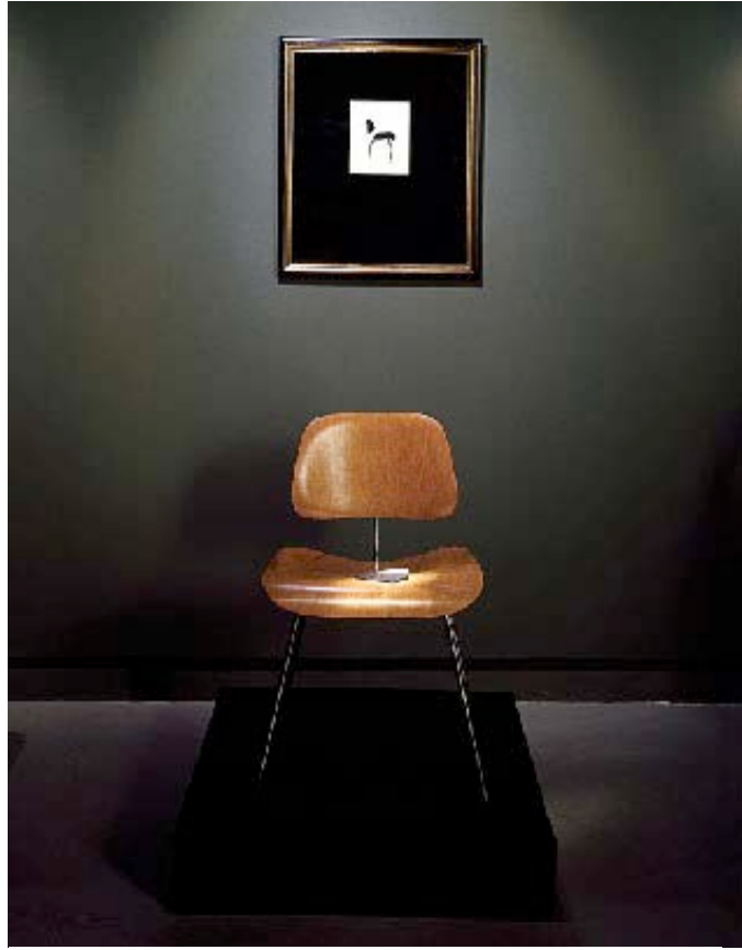
Barbara Bloom Pride from 'The Seven Deadly Sins', 1987, framed photograph in velvet mount, molded plywood Lounge Chair Metal by Charles and Ray Eames, calling card engraved with the word 'pride' on seat