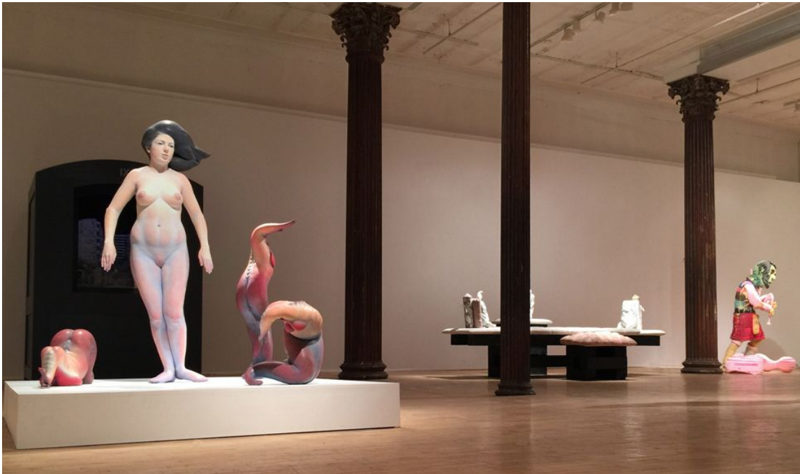
Installation view of "Beautiful Beast" at the New York Academy of Art.