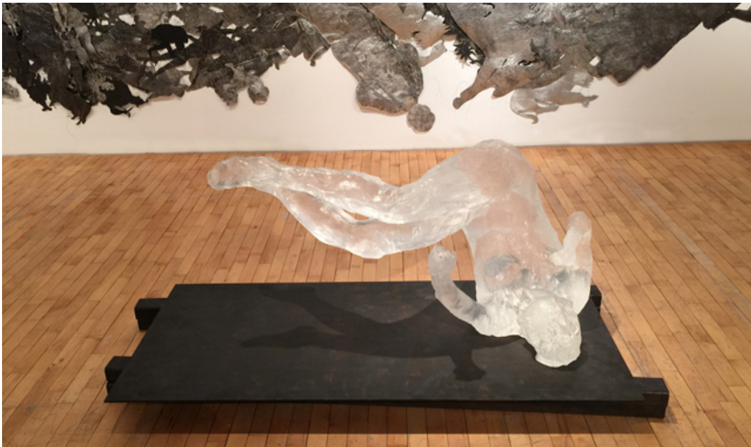
Eric Fischl's "Tumbling Woman II," 2015. (Courtesy of the artist and HEXTON)

Certain works in sculpture which give the impression of completely erasing any trace of the human hand are the exact opposite; requiring countless hours of tedious labor to achieve the look of a machine made thing. Ultimately, any artwork, regardless of its mode of creation, is the product of artistic intentionality — a question of individual intentions, aesthetics, and conceptual concerns. It's not the how, but the why?