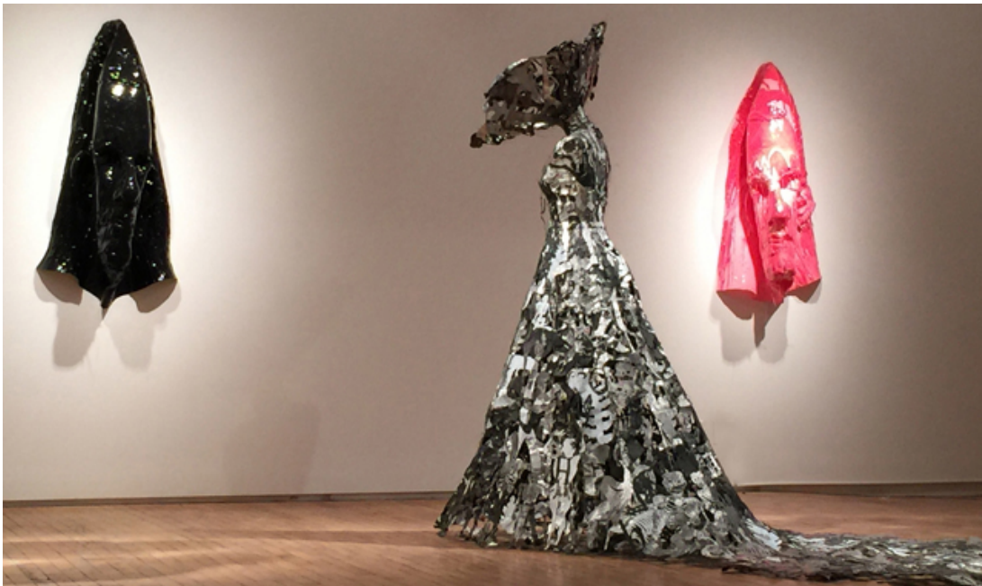
Installation view of "Beautiful Beast"

When I have a full-throated idea, I feel as if I am teaching, bit by bit, my team to sing the same song that I am singing, so that we have this group hum, and we are making the work from that kind of atmosphere.