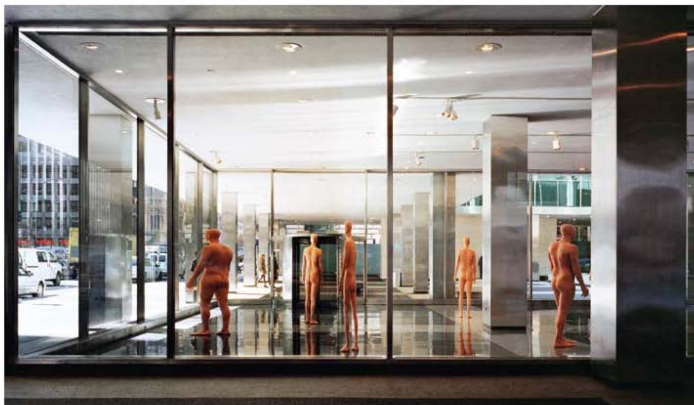
Richard Dupont, Terminal Stage , 2007–2008, nine cast polyurethane figures, 80 inches tall each, dimensions variable. Lever House Art Collection.