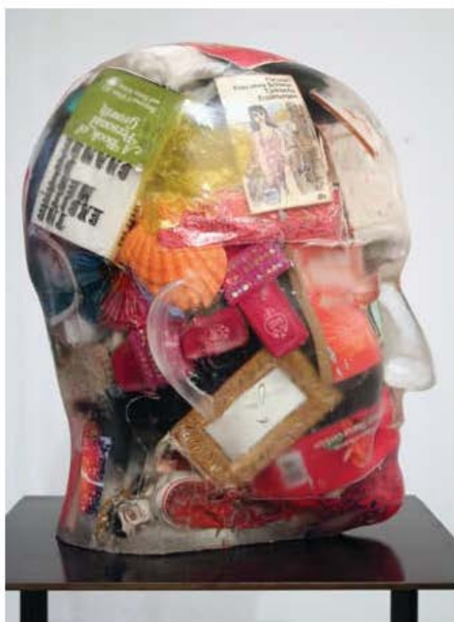
Richard Dupont, Collection Head 1 , 2011, cast UV stable polyurethane resin with studio and personal detritus, found objects, 26 x 16 x 21 inches.

It is telling that there is little distinction placed on whether the images are personal snapshots or mass-market postcards. They are memories of a place or a person; it doesn't matter if they are from Dupont's life or found pressed in a used paperback. Dupont's work deals at the concordance of private and public, of unique and idealized. The connection to Classical sculpture, which I have avoided until this point, immediately comes into focus. For the Greeks, memorial busts had two tasks: to capture the individual's essence, and to blend the personal into a matrix of classical ideals. While we have long moved past classical ideals, we are a society of standardization and averages. Dupont's heads do not represent the one platonic ideal, but the median of innumerable lives and experiences. In the vast