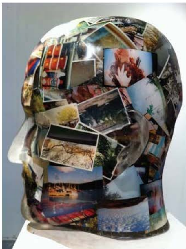
Richard Dupont, Memory Head , 2011, polyurethane resin with studio and personal detritus, found, salvaged, recycled objects, foodstuffs on artist's pedestal, 26 x 16 x 21 inches.

flow of digital images and status updates, the distinction between our experience and the lives of others becomes less and less distinct. The heads suggest that social media, by demolishing the borders between public and private, also make the individual completely anonymous.