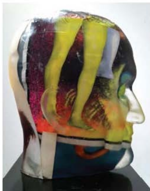
Richard Dupont, Cyclops Head , 2011, cast UV stable polyurethane resin with studio and personal detritus, found objects, 26 x 16 x 21 inches.